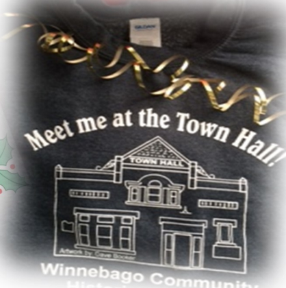
Sweatshirt $20 Hoodie $30